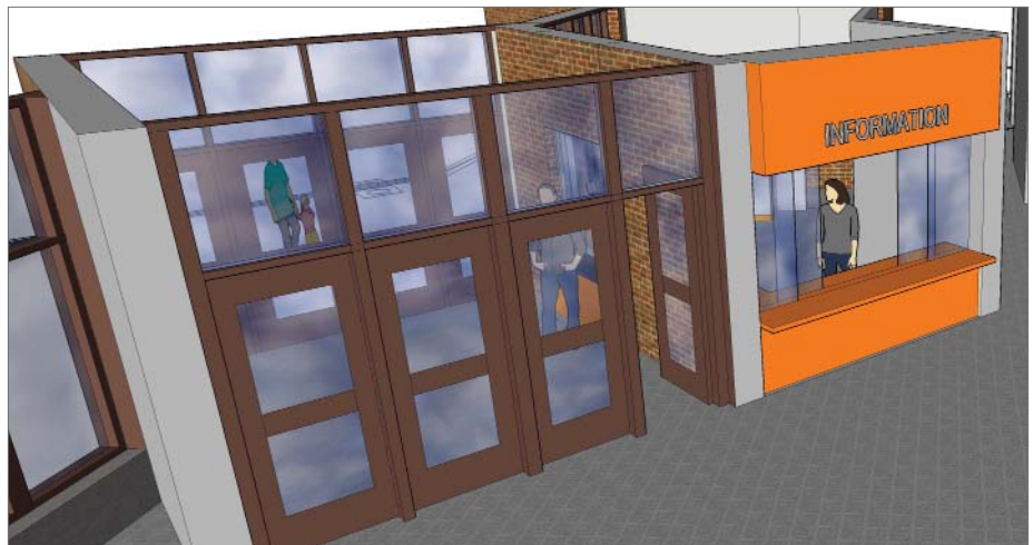
New High School secure vestibule with adjacent information office

The 2016 $100K Project includes the construction of a secure vestibule at the High School, along with an adjacent information office. Construction is planned to take place in the summer of 2016.