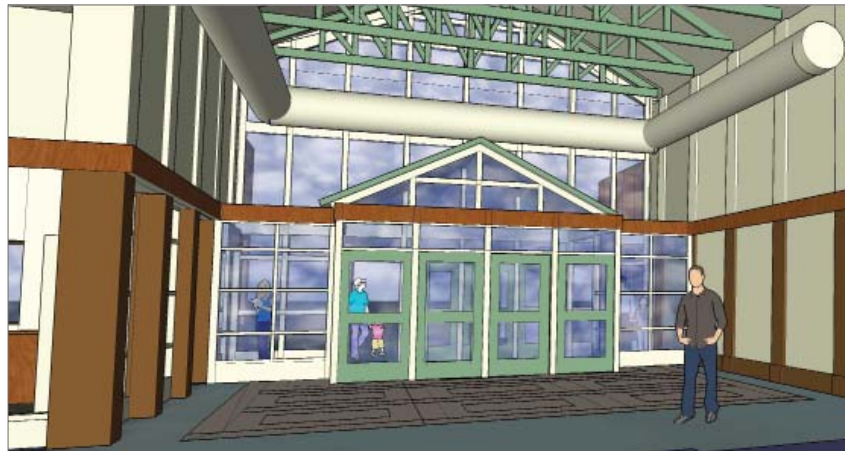
Secure vestibule at George F. Johnson