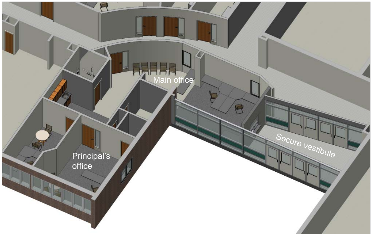
Secure vestibule at Ann G. McGuinness and Thomas J. Watson